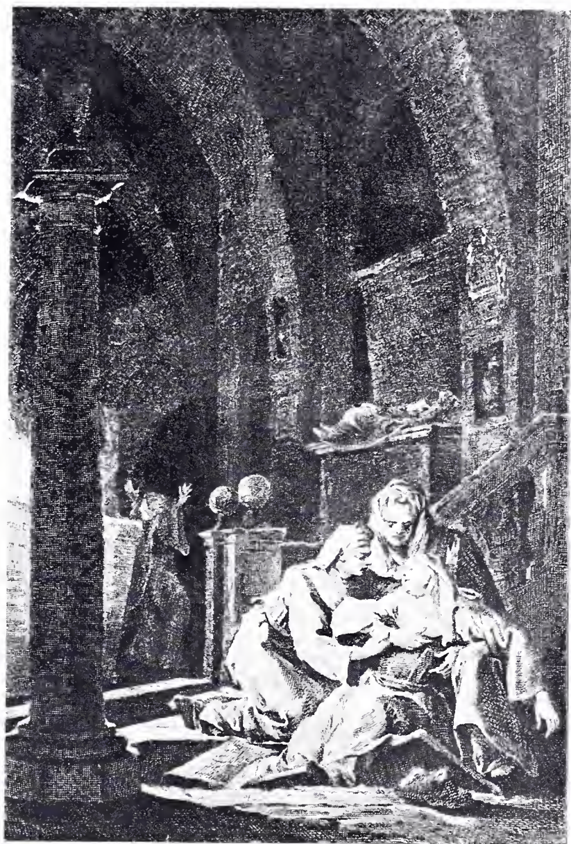
EUPHÉMIE, OU LE TRIOMPHE DE LA RÉLIGION Drama by Baculard D'Arnaud Frontispiece, Second Edition, 1768