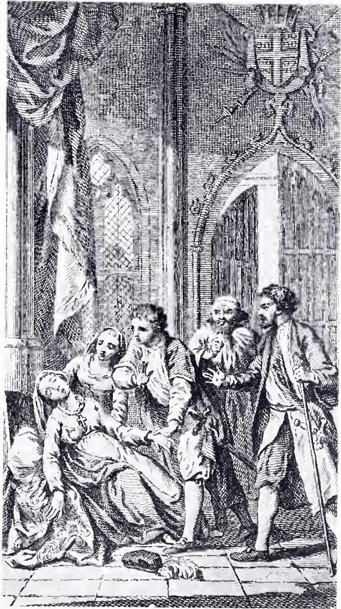
LONGSWORD, EARL OF SALISBURY Frontispiece, Vol. II, 1762